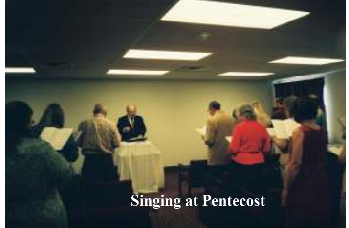
Singing at Pentecost