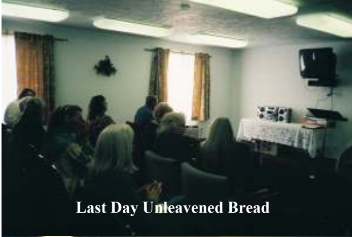
Last Day Unleavened Bread