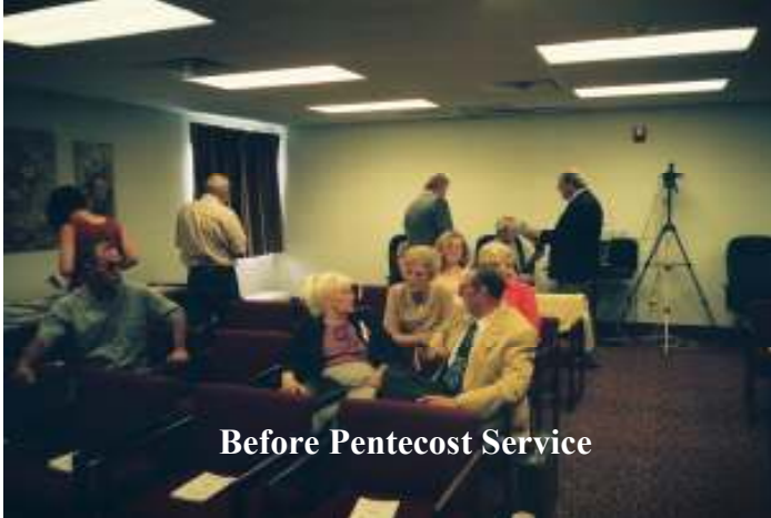
Before Pentecost Service