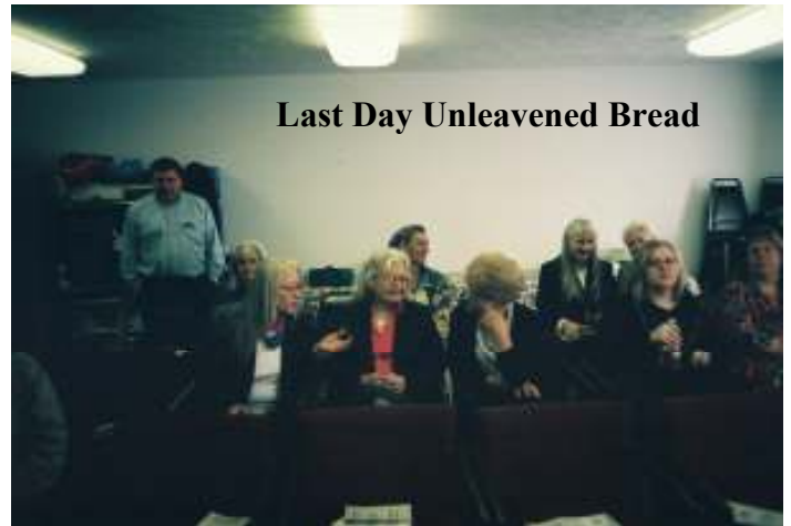
Last Day Unleavened Bread