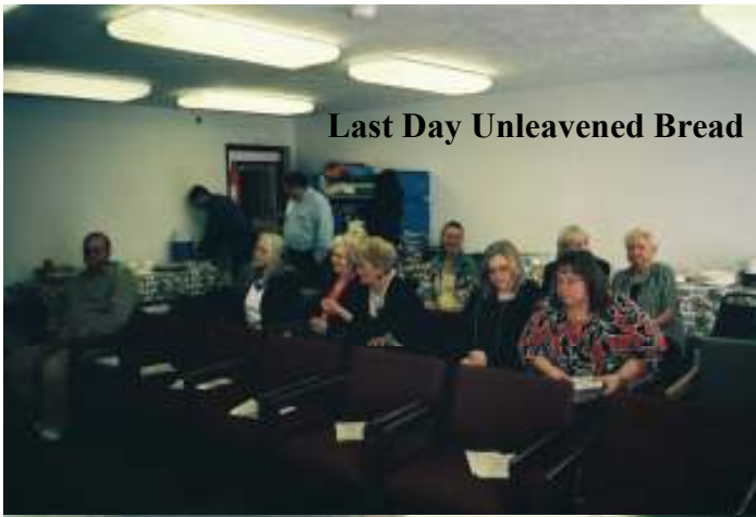
Last Day Unleavened Bread