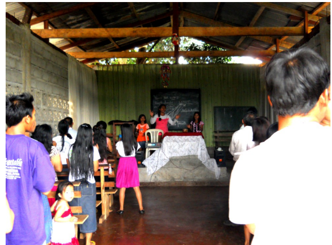
Classroom of Bible training school.