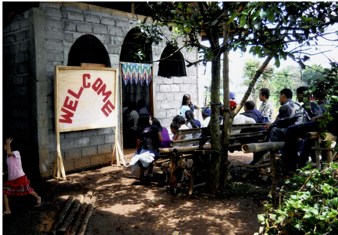
Brethren outside during Thanksgiving anniversary, Child dedication and Graduation Service.