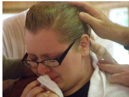
Tears of joy.

then she is and as her dad, it has made me so proud to watch her grow in that love. We had talked about her baptism for several months and we chose to wait until the Feast