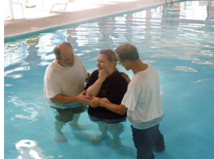
Preparing for baptism.